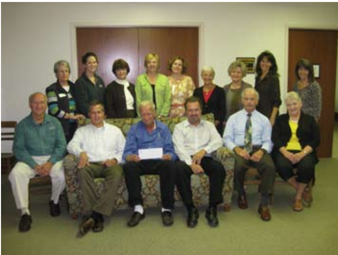
Jean Louise Thieme Children's Theatre Fund. Darke County Center for the Arts board of directors gather to receive the annual distribution from the Jean Louise Thieme Children's Theatre Fund.