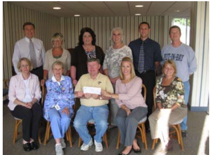
Low Vision Support Group Fund. FAME (Financial Assistance for Medical Emergencies) receives its annual distribution from the Low Vision Support Group Fund.