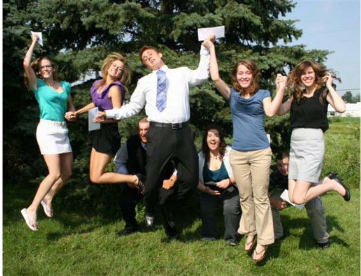
With checks in hand, Versailles High School graduates show their excitement at receiving scholarships from the HOPE Foundation. Story on p. 4.